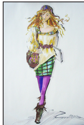
Illustration by teacher Gloria Nilsson

Love Fashion? Turn your fashion ideas into vibrant fashion illustrations. Learn about the fashion silhouette, anatomy & gesture drawing that will take your sketches to the next level. Repeat fashion students refine their drawing skills, focusing on design details. Material list available.